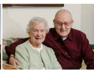
...an outstanding place to live, invest and bring up families